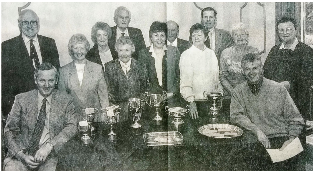
1998 AGM prize winners