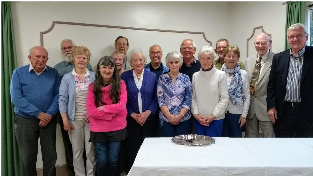
2019 AGM prize winners

From 2015 the membership started growing. The summer bridge was a catalyst for many people joining the club and some bridge players retired or moved to the area. This was in stark contrast to many clubs who were struggling with an aging membership. The general friendliness and welcome at the club, the spirit of all the volunteers who help out at summer and winter bridge, and the work of the partnership secretary all contributed.