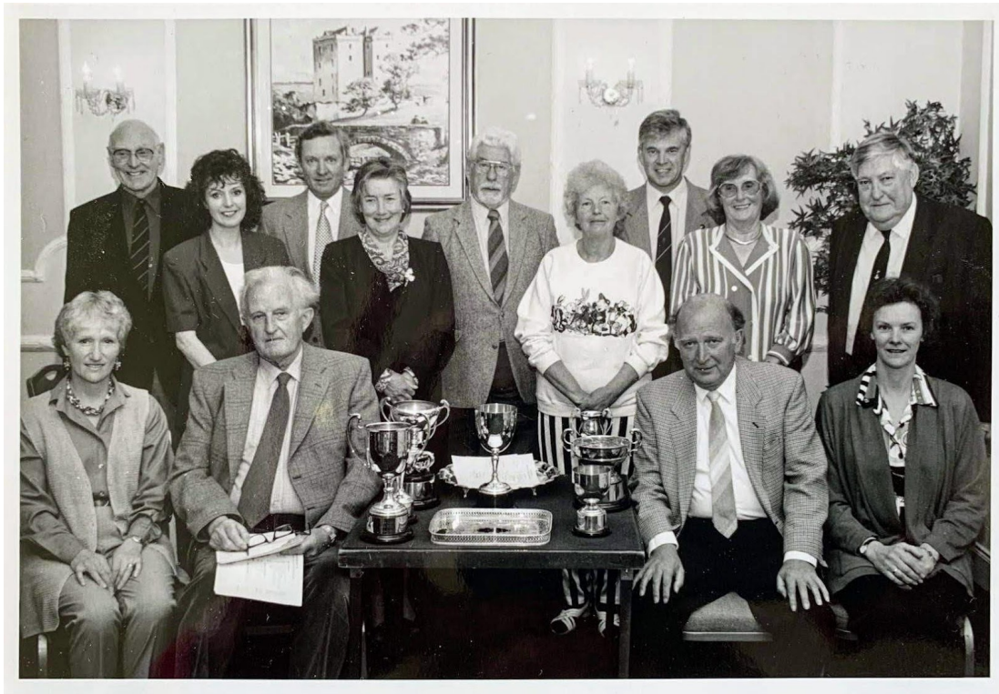
1990-91 prize winners

At the 1991 AGM there was a move to increase the number of matchpointed club events. The Committee had discussed changing all the aggregate evenings on Thursdays to matchpoints, but this was never put to the AGM as planned, for some reason.