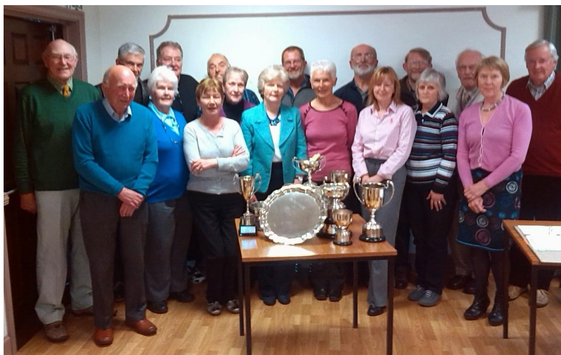
2015 AGM prize winners