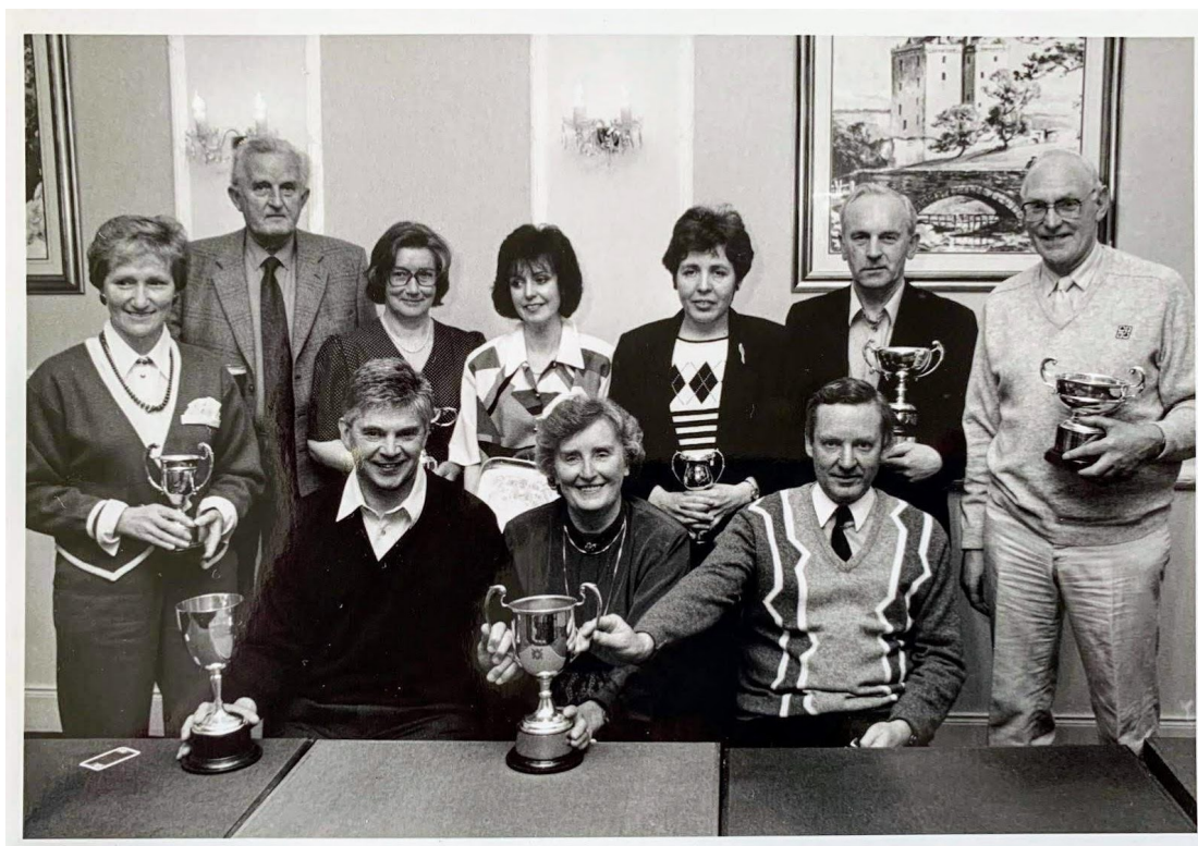
1991-92 prize winners

Prior to the 1992 AGM, the Committee noted that the President was elected for three years and not as written in the Club Constitution: the Committee seemed unfazed by this difference. They also decided that a randomiser should be used to deal the boards and there is the first mention of someone writing a history of the club.